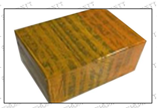
Pic No. 3