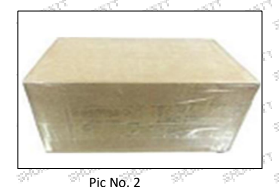
Domestic express packaging:

Minors are prohibited from using transparent tape, yellow tape, black wrapping protective film, and white wrapping protective film to avoid personal injury.