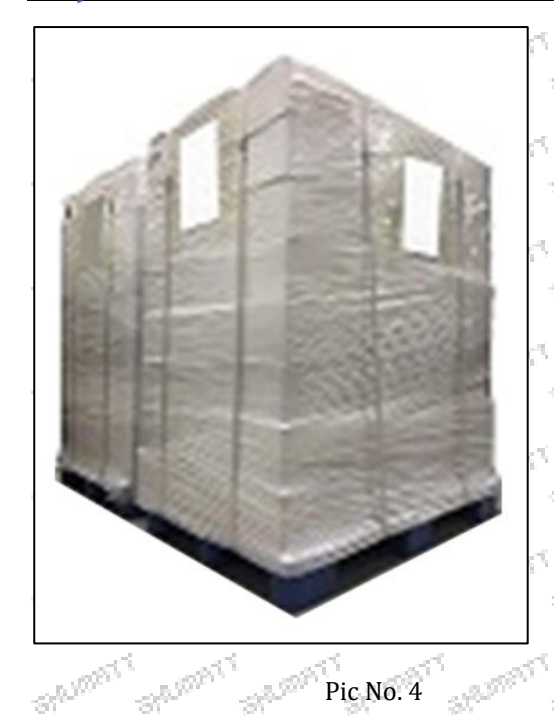
Pic No. 4

Pallet Shipping: Use pallet that meet export requirements, and use white wrapping protective film to wrap and bind with cable ties